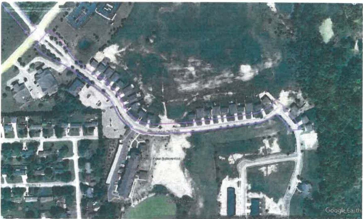
Figure 2 – Google Earth image from May 2023, post-development. Land on north side of Woodbridge Park Blvd is utilized for single-family dwellings. Land on the south side of the road is an assisted living apartment complex.