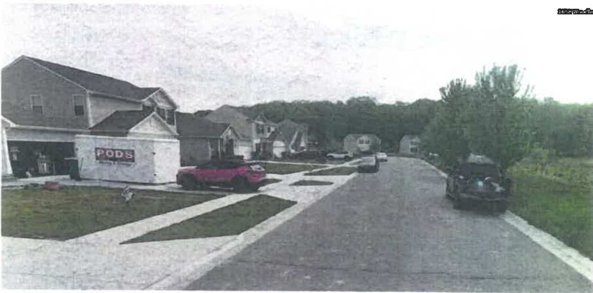
Figure 4 – Looking easterly along Woodbridge Park Blvd toward east end. Vehicles parked on both sides of the roadway. Causing through traffic to weave back and forth along the road. Width of road does not support parking lanes.