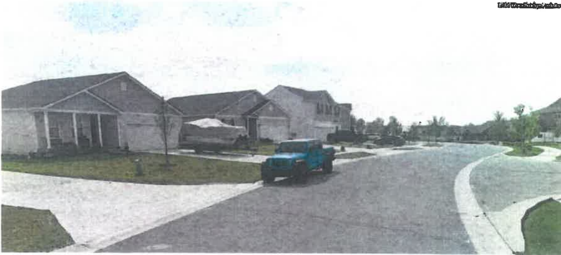
Figure 3 – Looking easterly along Woodbridge Park Blvd. Vehicle parked across from main commercial parking lot entrance. Limiting turning movement ability.