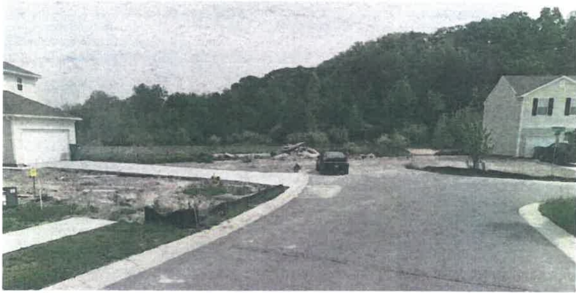
Figure 5 – Looking easterly along Woodbridge Park Blvd. Vehicles utilizing end of roadway turn-around for parking. Limiting the ability for county snow trucks to turn around at the Township / City Limits.