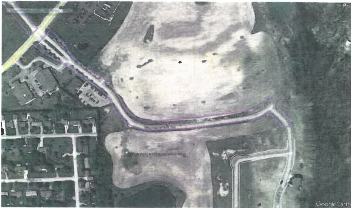
Figure 1 – Google Earth image from March 2019, pre-development. Land on north and south side of Woodbridge Park Blvd is farm land. City of Lapeer subdivisions to the south have not been developed to full build-out.